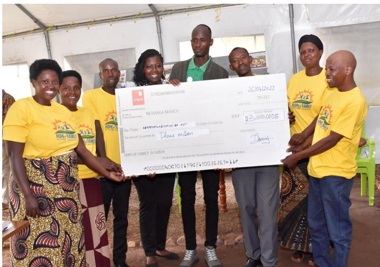
HoF provide 3million as financial assistance to her beneficiaries to be borrowed from their saving groups hence boost their small and income generating projects.