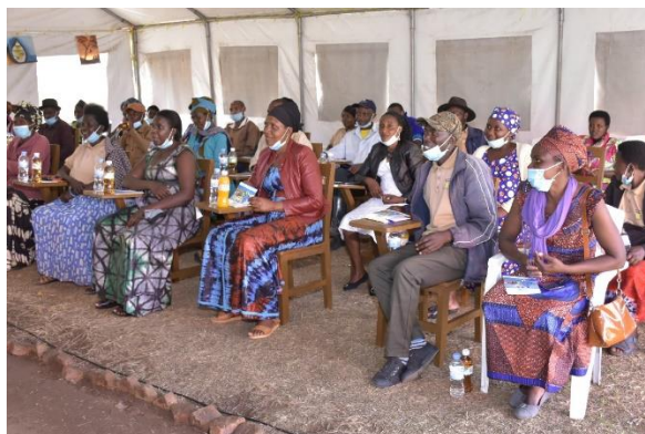
A learning workshop for community leaders and community health workers held in Shyogwe sector