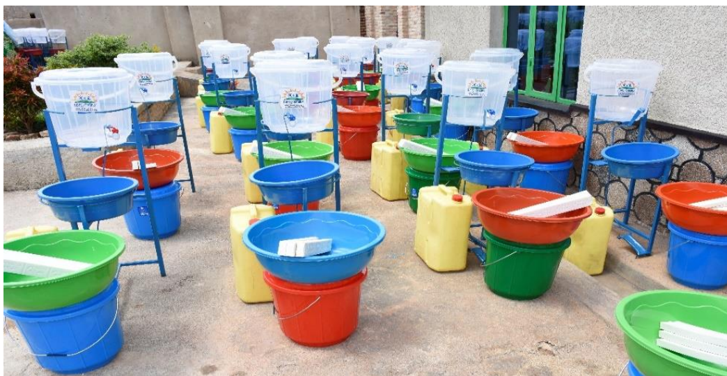
Distribution of hygiene and sanitation materials to assist households remain hygienic and clean