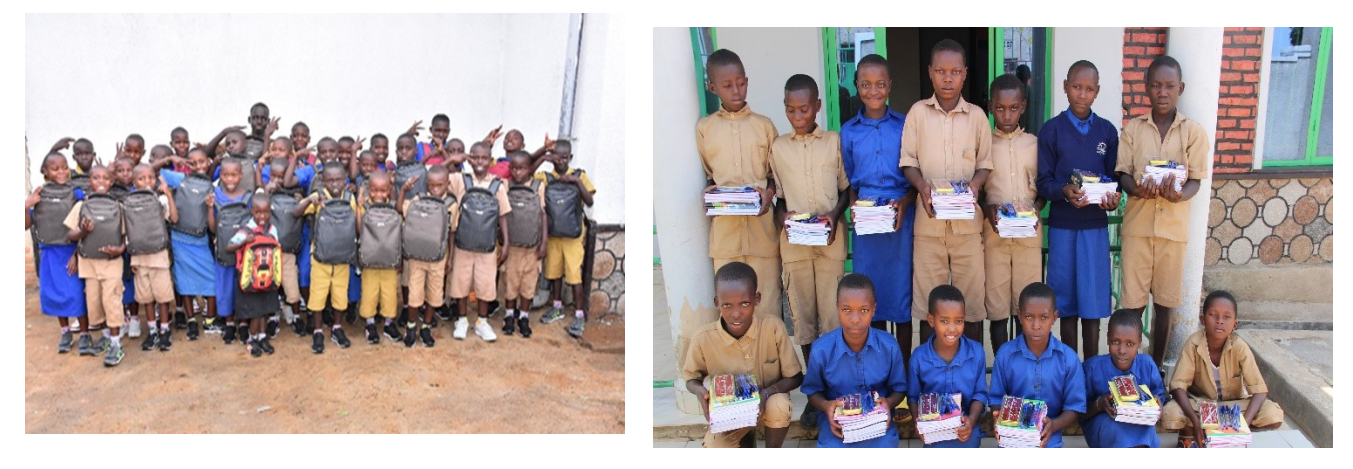
Photos: sample photos showing children with some basic school materials

HoF provides wrap-around support to children from vulnerable families in order to improve physical, emotional, social, ethical and academic behaviour of children, increase performance of children at school, increase school attendance rate and reduce dropout rate.