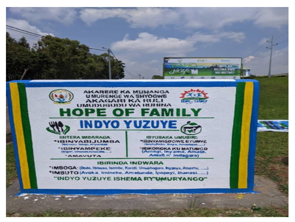
Photo: block poster constructed in one of villages of Shyogwe sector

In addition, HoF constructed 23 block posters (ibicumbi) in various locations (one in each village) of Shyogwe sector so that the community at large can learn how to prepare a balanced diet for fighting malnutrition as one of the issues threatening our country. They learn through reading what is written on the block posters regarding how to prepare a balanced diet. Many researches show that, stunting for children affect their performance at school. It is the reason why Hope of Family is committed to improve families' nutritional status in order to have children with good health hence increases their rate of performance at school.