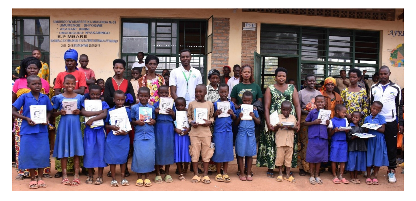
Photo: Children from Mbare Primary School who performed well at school are awarded

In this year, 57 children from Mbare Primary School who performed well at school are awarded. This a motivation for supported children in order to improve their performance in the future. Around 80% of children in our program are students from this school. Hope of is committed to improve education of children from this school by motivating students and teachers in different areas of development.