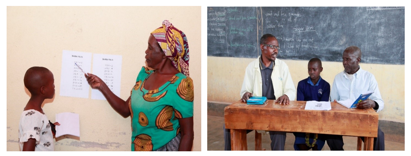
Photos: Parent who supporting children in home learning and other who visited children at school

In this context, Hope of Family has developed a module to use in the parental coaching and this happens on the monthly basis. During the fiscal year 2022-2023, seventy-five percent (75%) of parents whose children are under HoF care were able to visit their children at school and interacted with teachers on their children schooling