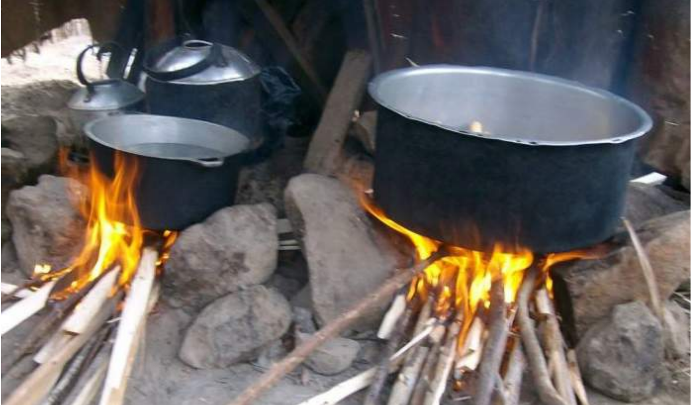
Poor cooking style leads to negative impacts on Air quality